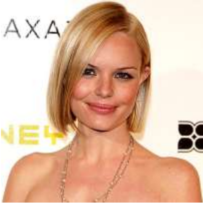
Kate Bosworth bob without fringe.