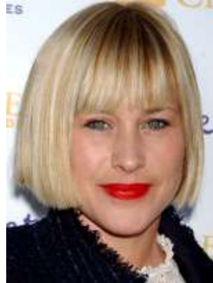
Patricia Arquette bob with fringe.

Sunday March 20, 2009 The Chicago Tribune (my hometown news paper) published an article with the headline “One Haircut. Endless possibilities.” The writer describes the long bob that’s angled and stacked ever-so-slightly as “the little black dress of haircuts”. Shorter in back and collarbone-grazing in front is the go-to cut for gals who want maximum versatility with minimal fussing. “It’s classic, but chic.” The March issue of Vogue says the freshest look for hair is neither long nor short; it’s jaunty and healthy and touches the shoulders, but manages to look effortless. The cut has wisps cut into the ends to add texture and keep it from looking too chunky. The bangs are blended into the front hairline with some longer layers.